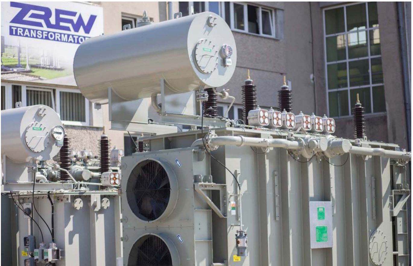
Transformers ready for transport