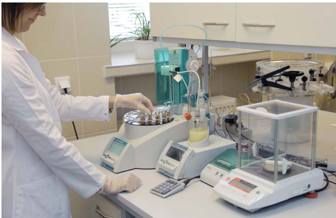
Our laboratory - the most modern in Poland