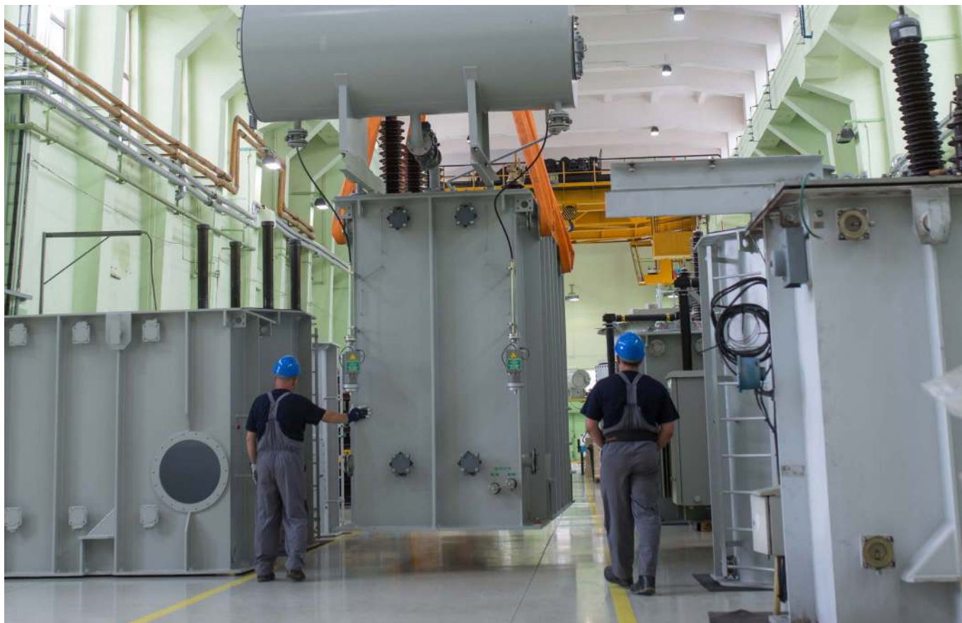
Transport of a power-transformer in our factory in Łódź, Poland

Besides the production of transformers, the portfolio of ZREW is complemented with offerings for maintenance, modernization and diagnostics.