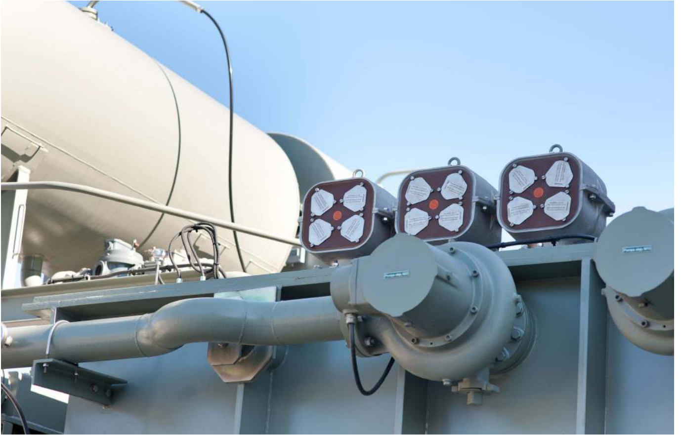
Transformer equipped with Pfisterer Connex