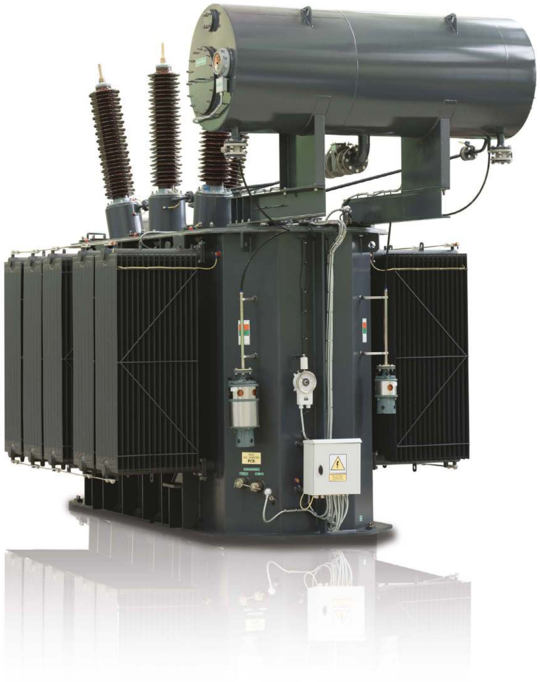
Type of transformer: TJRc 16 000/110 Power rating: 16MVA Voltage: 110/10,5kV