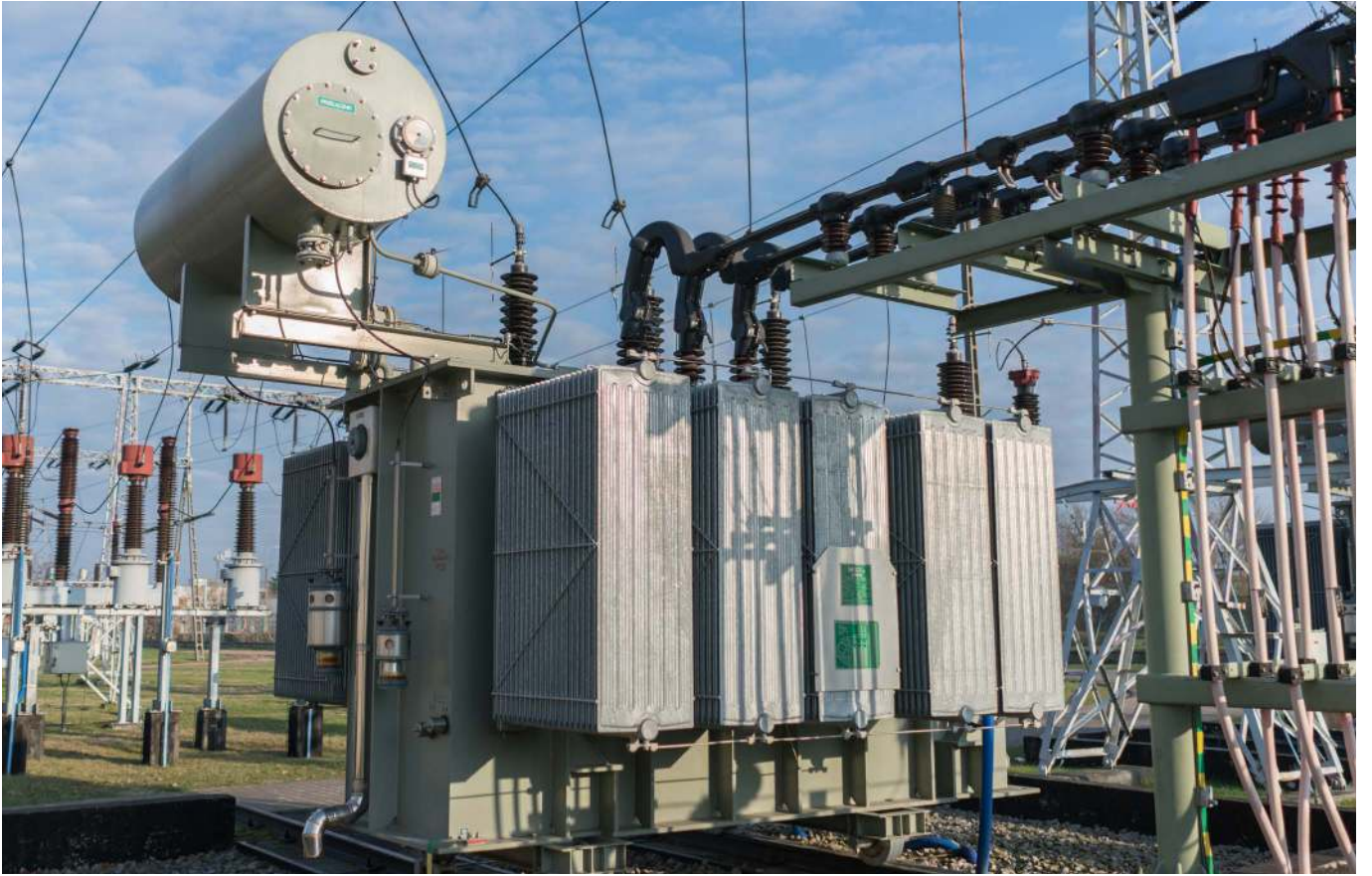
ZREW transformer installed in a substation